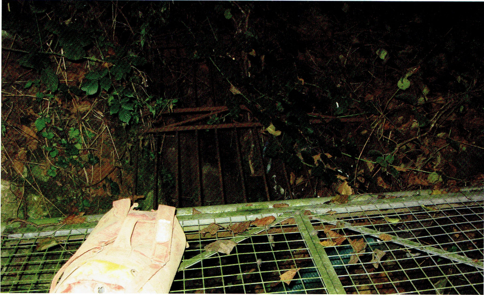
The cave gate/door & bat grill.