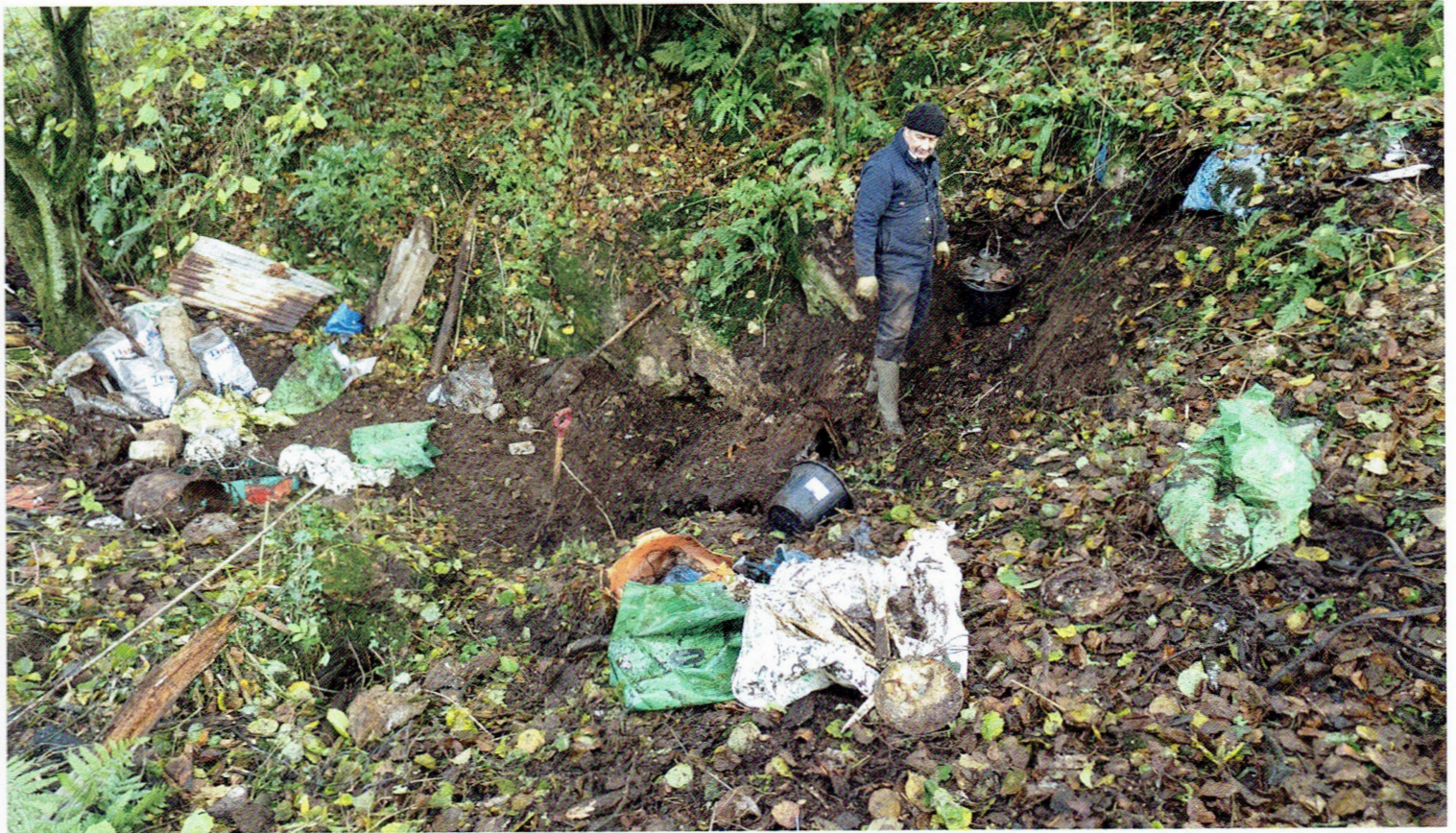
A swallet sink hole containing a farm rubbish