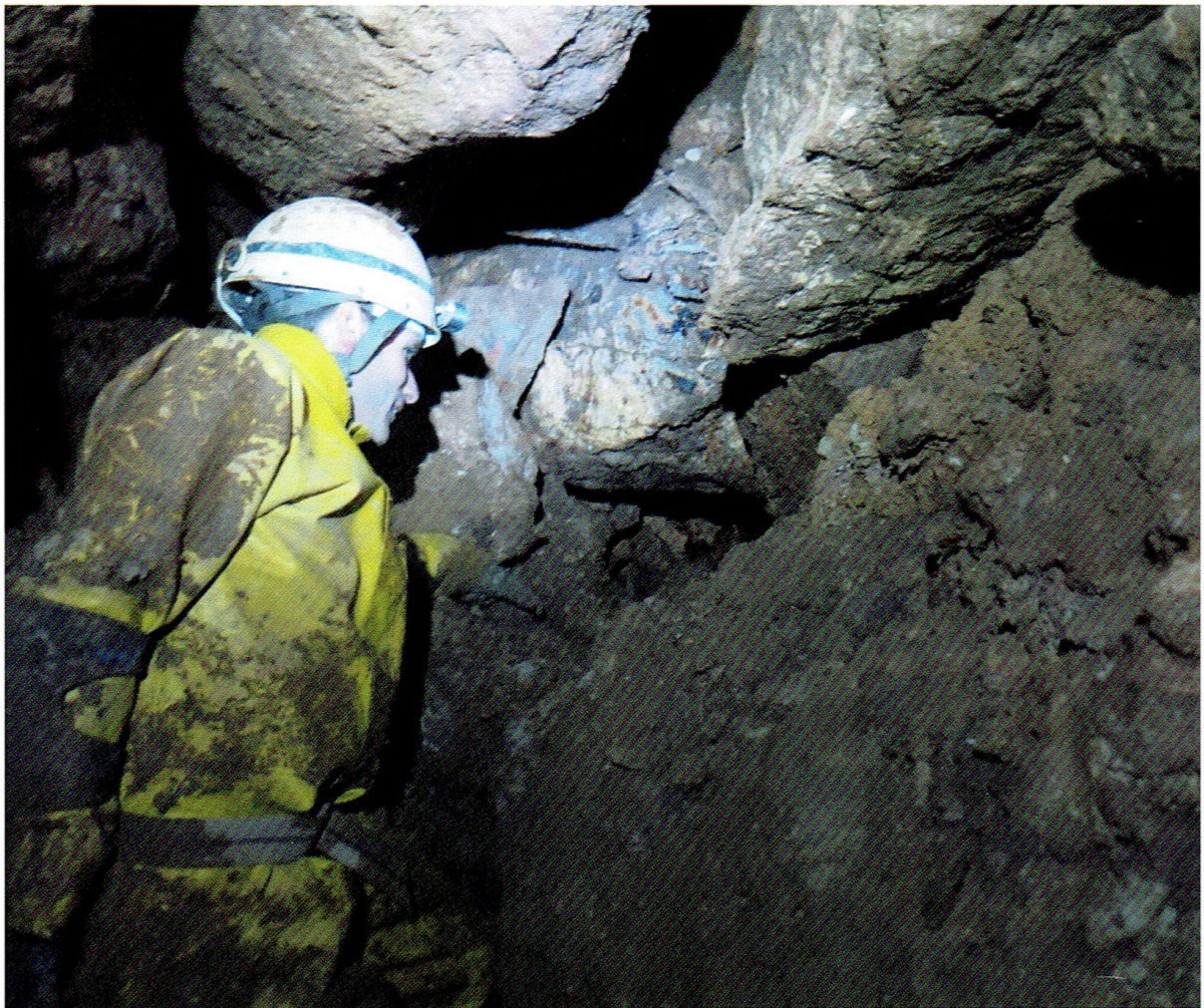
Looking at another "breakthrough point" Matt. Below: The just opened Trapdoor leading onwards.