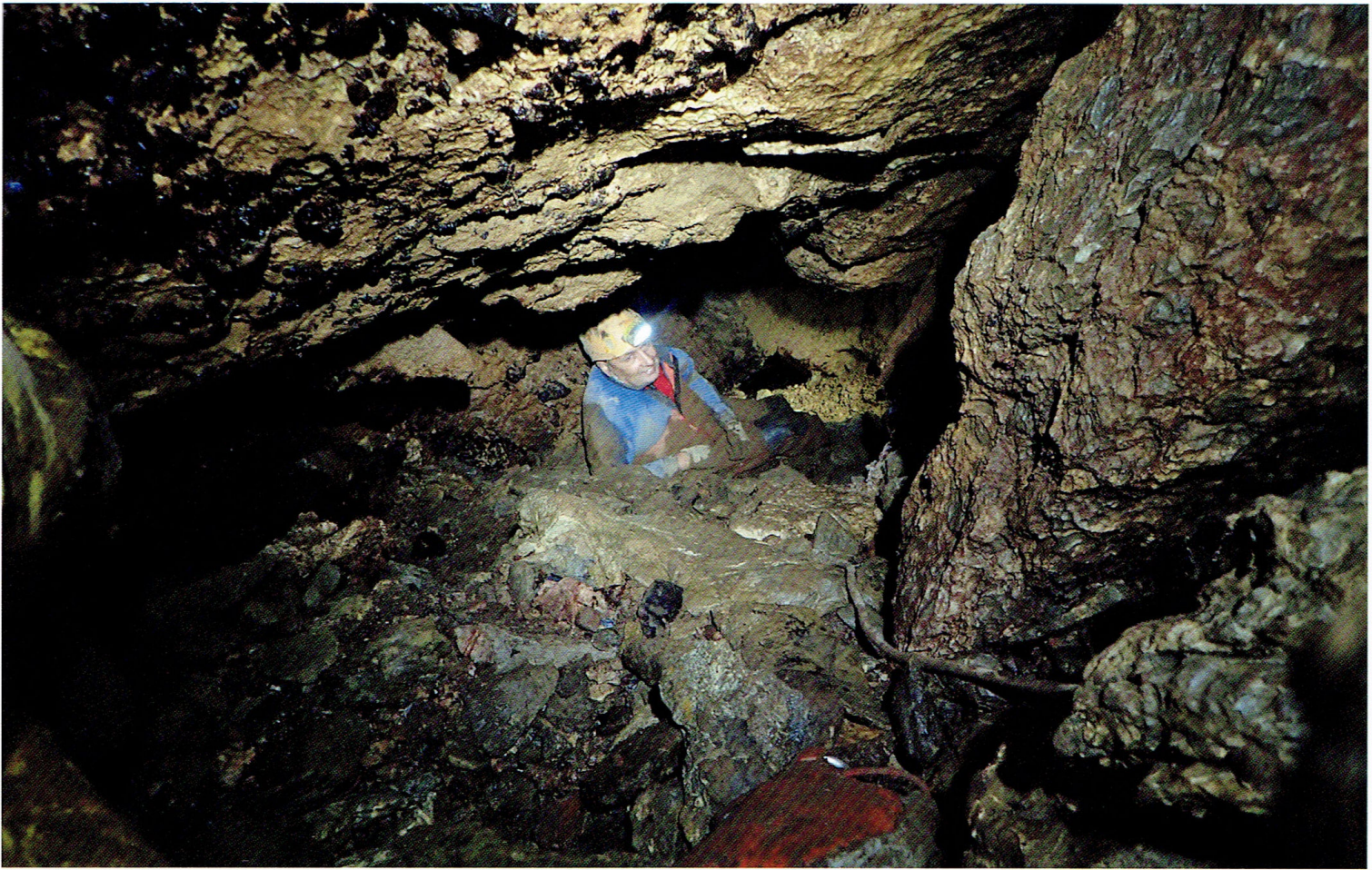
The bedding chamber passage below the Trapdoor. Below still going down & the end so far Oct 2021.